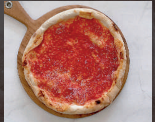
10" PIZZA ROUND NAKED

Baking Style: Frozen/Thaw Unit Weight: 260g