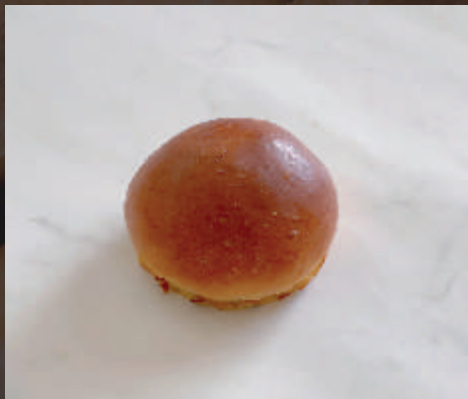
BURGER BUN SMALL

Baking Style: Frozen/Thaw Unit Weight: 120g