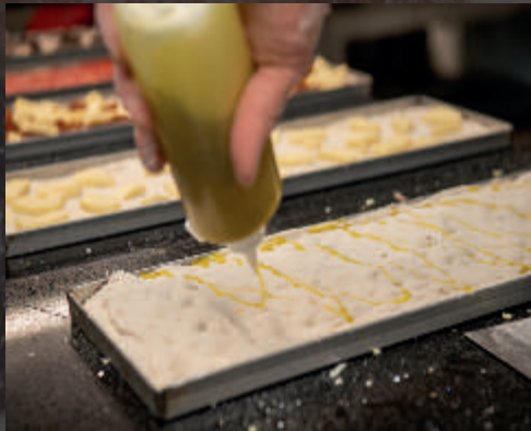
PLAIN PIZZA SLAB NAKED

We take pride in crafting delicious and authentic stone-baked pizzas. Each pizza is made with the freshest ingredients and carefully prepared by our skilled pizza makers. To ensure your convenience, we also freeze our pizzas so you can enjoy them whenever you want. Simply display or place them in the oven from frozen, and you'll have a delicious pizza ready to enjoy in no time.