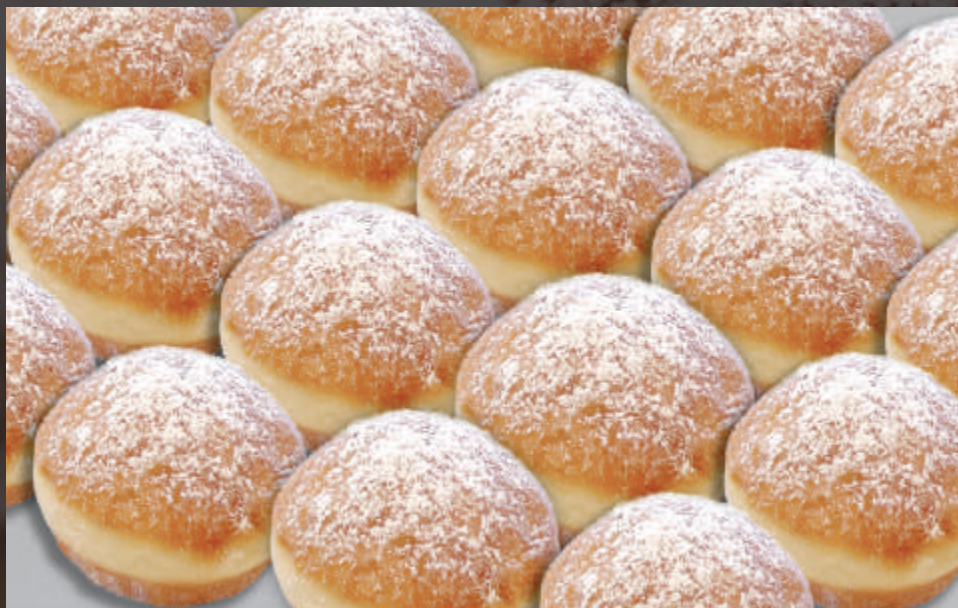
BOMBE (NAKED) - Large

Baking Style: Frozen/Thaw Unit Weight: 80g