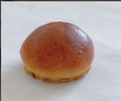
BURGER BUN LARGE

Baking Style: Frozen/Thaw Unit Weight: 120g