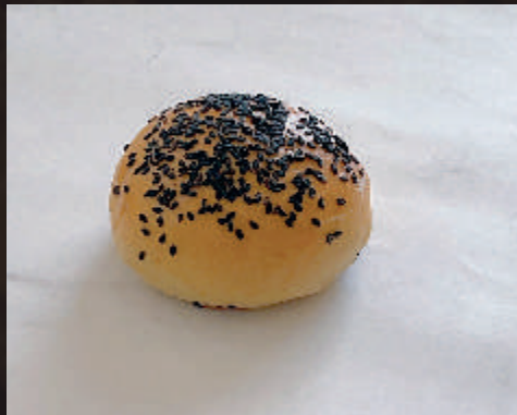
BLACK SESAME BUN

Baking Style: Frozen/Thaw Unit Weight: 60g