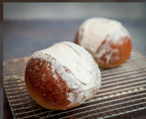
MARITTOZO (NO CREAM)

Apricot Jam, Raspberry Jam, Pistachio, Choc Hazelnut